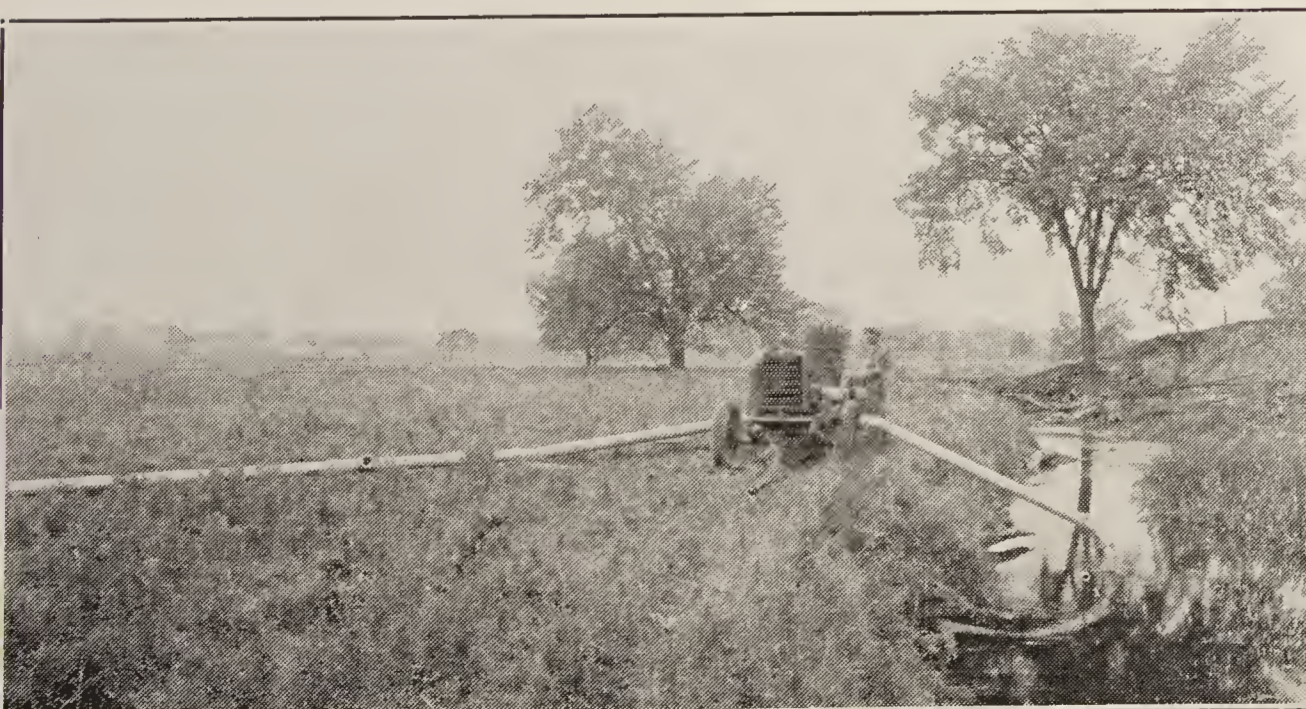
At the "pumping station." This Union pump can take 500 gallons per minute from Flint River, part of which flows through the Jarvis' farms. The pipe is Champion light weight 6 inch steel feeding into 4 inch tubes.

To grow America's Finest GENUINE NORTHERN GROWN Boysenberry plants for resale purposes, one of Michigan's largest irrigation systems was installed. Only specialists in a specialized line would go to this expense. Avail yourself of plants now scientifically grown. MAKE RESERVATIONS EARLY TO INSURE DELIVERY WHEN THE TIME ARRIVES FOR SUCCESSFUL PLANTING.